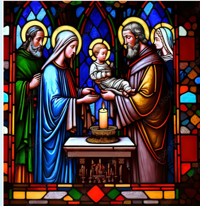
The presentation of Jesus in the temple, Simeon and Anna the prophetess meet Jesus, whom his parents brought to the temple.