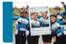
Peter McVerry Trust Wexford Cycle 2022 Saturday 17th September

The annual Peter McVerry Trust Wexford Cycle 2022 will take place on Saturday 17 th September.